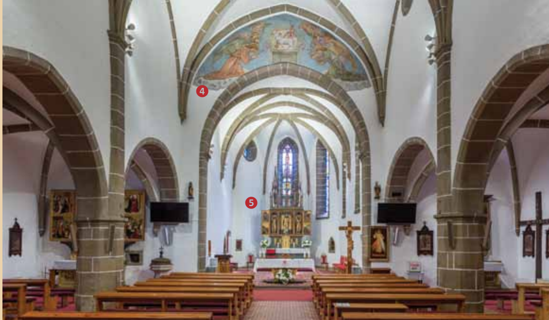
The view of the main nave with the triumphal arch (4) in the axis of the church and the Altar of St. Nicholas (5) in the background. Altars no. 2 and 6 can be seen in side naves behind massive pillars.

Have a look at the jewels of the oldest constructional monument in the town – the biggest Early Gothic building in the region of Liptov! It was built as a parish church for 5 nearby settlements. Firstly, it used to stand alone in the middle of the countryside, then the town of Svätý Mikuláš was developed around it step by step. This imposing sacral building is located in the place where there was an older Romanesque church in the past. When the one-nave Church of St. Nicholas was being built in 1280 - 1300, the Romanesque church was changed to a sacristy and became the oldest part of the whole temple. The church was widened and vaulted in the mid 15 th century, the tower was made higher and redesigned in the Late Gothic style. In the same period, the whole temple got fortified along with Pongrác curia and a moat was built around. Later, it underwent a Baroque renovation. After an extensive reconstruction of 1941-43, the church could shine again in its Early Gothic design. The fortification wall was removed and side chapels with beautiful stained-glass windows were built next to it.