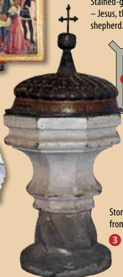
Stone baptismal font from 1490.