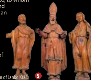
Wooden Baroque sculptures exhibited in the Museum of Janko Král’.

9 A sundial in the southern section of the church is decorated by a ceramic relief that symbolises the fight of St. George with a dragon.