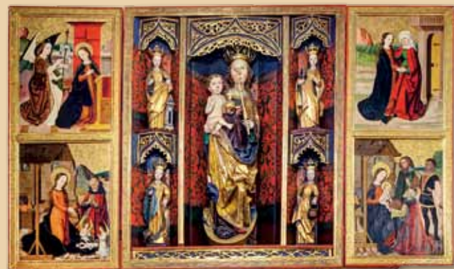
Altar of Virgin Mary from the 15 th century.